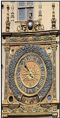
Gros Horloge Rouen