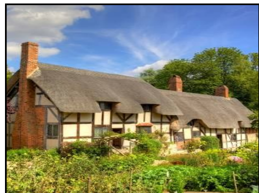
Anne Hathaway's cottage

And then, of course, there is Twelfth Night at the Royal Shakespeare Theatre on the Waterside