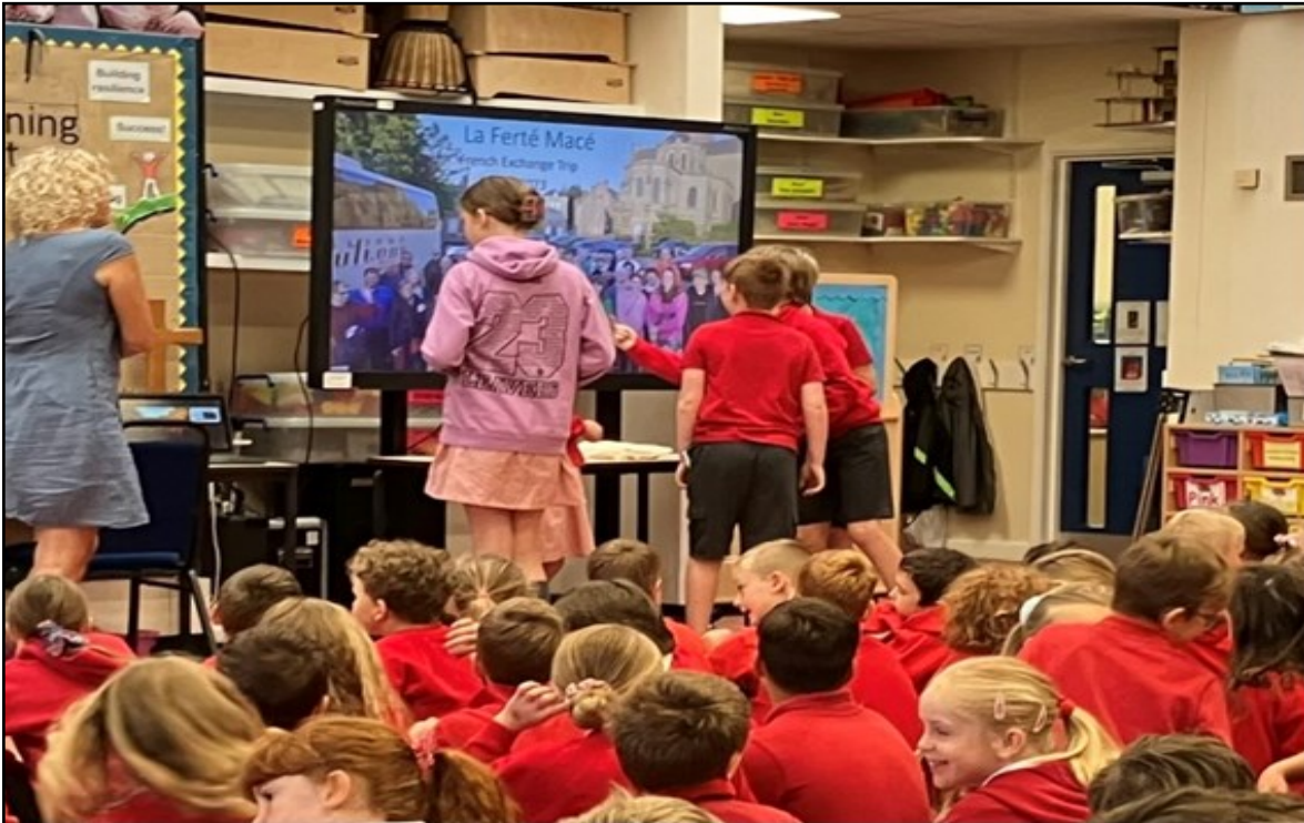
A presentation at school assembly on the visit to La Ferté Macé