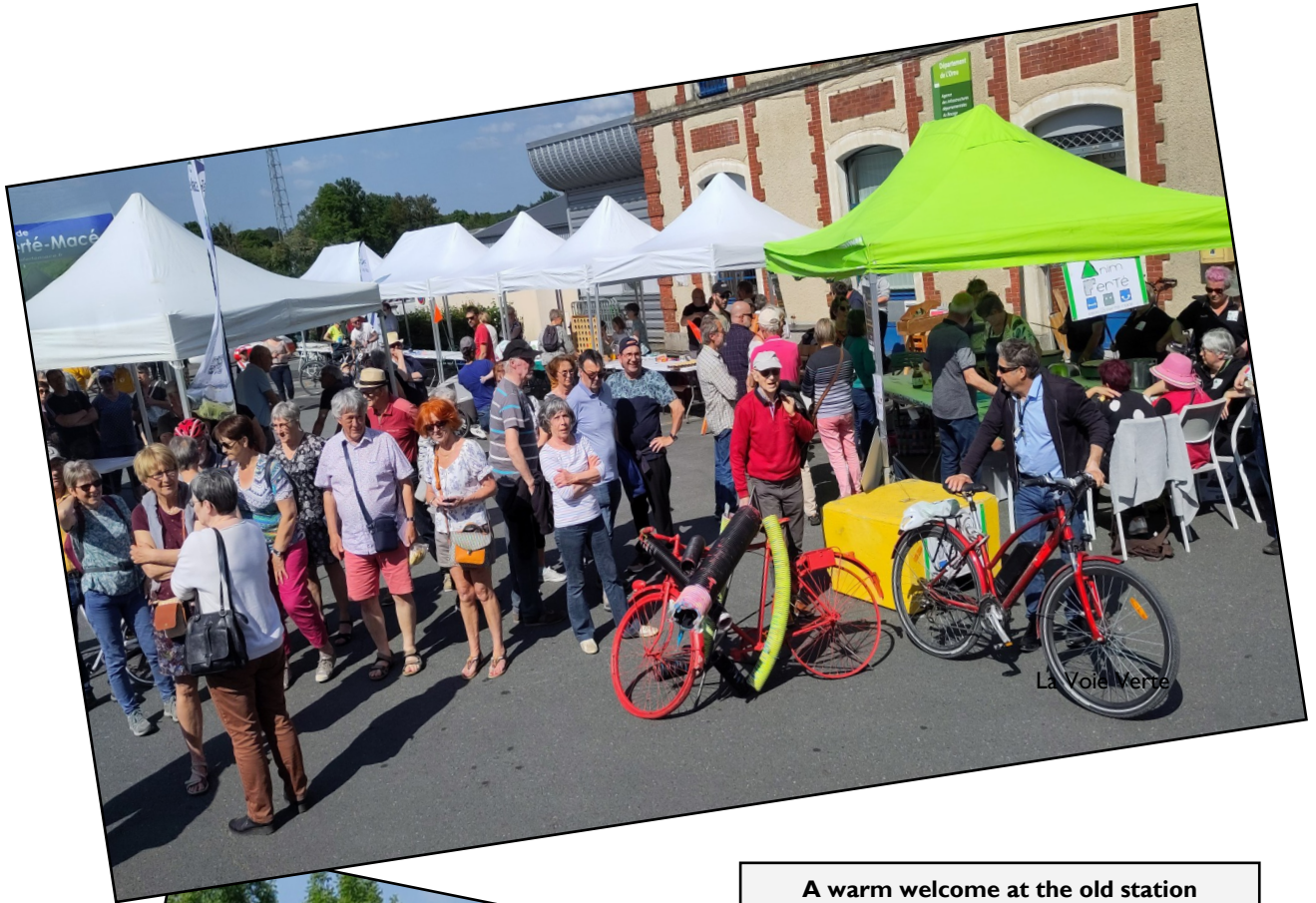
A warm welcome at the old station