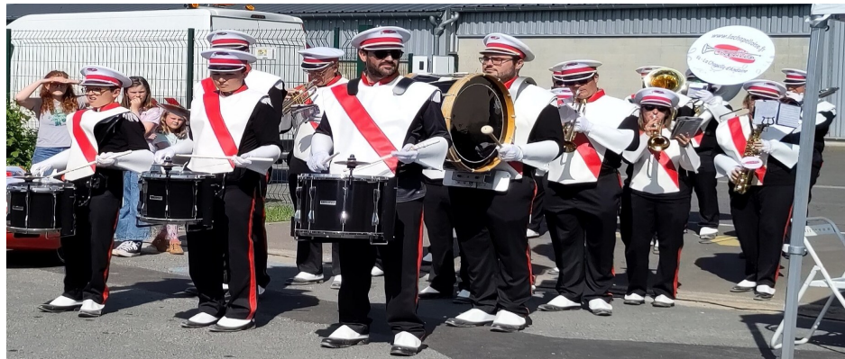
The welcome band for the opening of La Voie Verte and our arrival

This year's visit to France by forty members included a contingent of ten under-18s, and several who were making the trip for the first time. Although this visit required a longer-than-usual road journey on both sides of the Channel, due to lack of suitable crossings from Portsmouth to Caen, travelling from Newhaven to Dieppe gave us the chance to visit Rouen . Once again, the whole visit was accompanied by bright sunshine. The weather enabled us to enjoy the charms of Rouen and a warm welcome at the opening of La Voie Verte. An excellent visit to the Ferme du Cheval at La Michaudière followed for everyone. For some, Swin golf was a new experience, whilst others enjoyed the delights of the Andaine at such wonderful spots as L'étang de Lande-Forêt with our generous hosts .