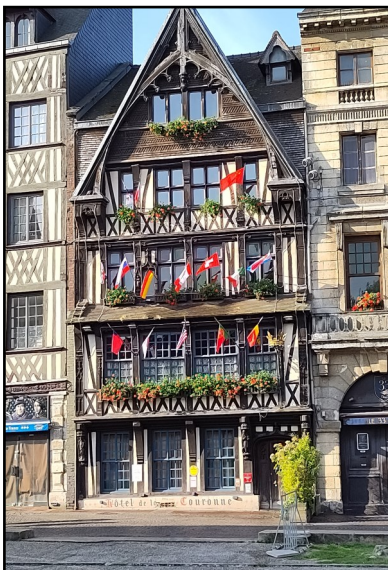
One of Rouen's listed buildings