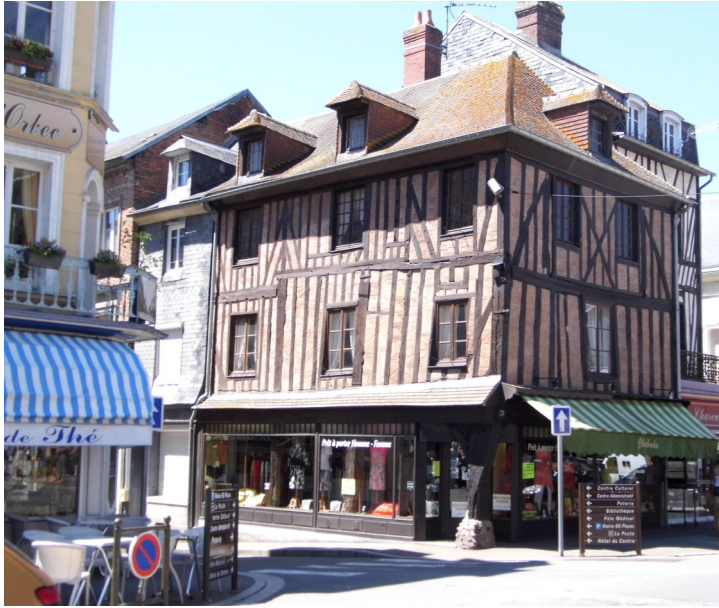
A typical Orbec building