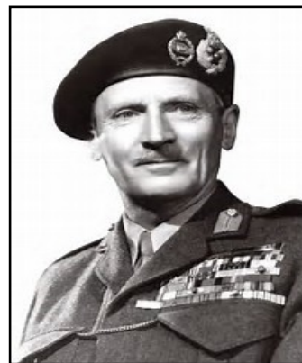
Field Marshal Bernard Montgomery

The double irony is that Rommel was killed in the area, too. His car, when strafed by Spitfire bullets struck a tree causing fatal injuries to the field Marshal.