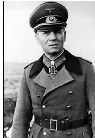
Field Marshal Erwin Rommel

Now that you have read a little of the origin of the name Montgomery, you may understand why this article is entitled 'An irony of history'. We have mentioned elsewhere in this newsletter the great battles of the Normandie campaign during World War Two. The irony is that two of the main protagonists, Field Marshals Montgomery (British) and Rommel (German) both 'came' from the area where they were engaged in conflict.