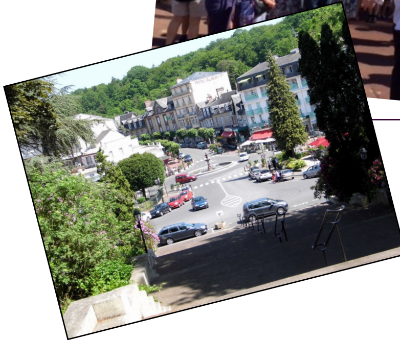
The centre of the town