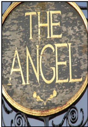
Town social tour-see page three