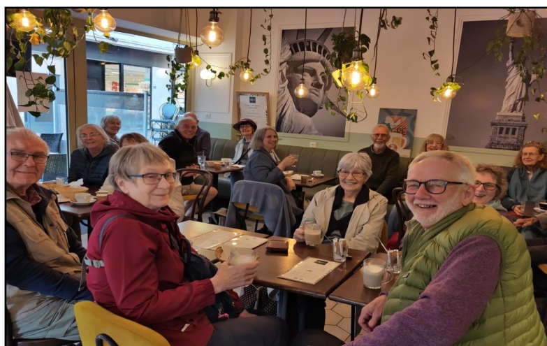
Ludlow twinnings in Rouen May 2023 (Senior section)

This is a slightly longer visit than normal which requires extra care in setting out an interesting timetable of events. Work is well underway and we shall involve and inform you as we continue to progress.