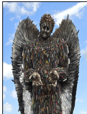
The knife Angel

gaged on a project which could embody a more meaningful concept and could make a difference within the community and throughout the country as a whole. A national monument against violence and aggression was sculpted from knives which had been confiscated by or surrendered to the police.