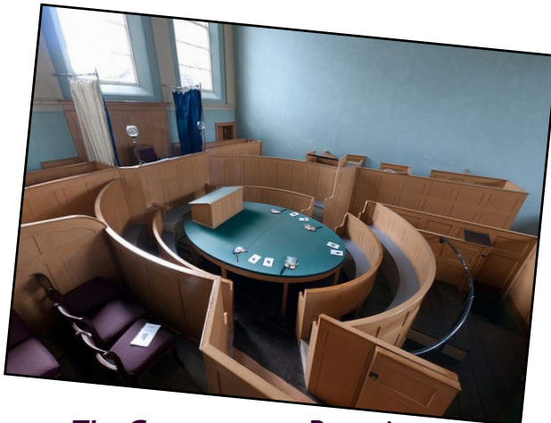
The Courtroom at Presteigne

It's worth allowing about ninety minutes or more to get best value from your visit.