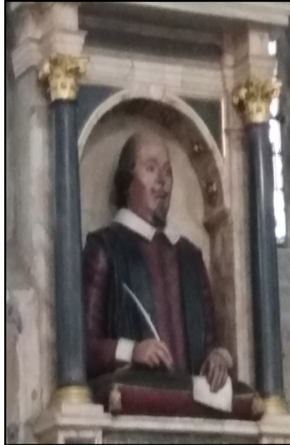
William Shakespeare is buried in Holy Trinity Church,