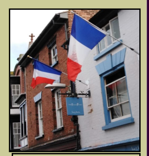
Solidarity with France. But where is this?